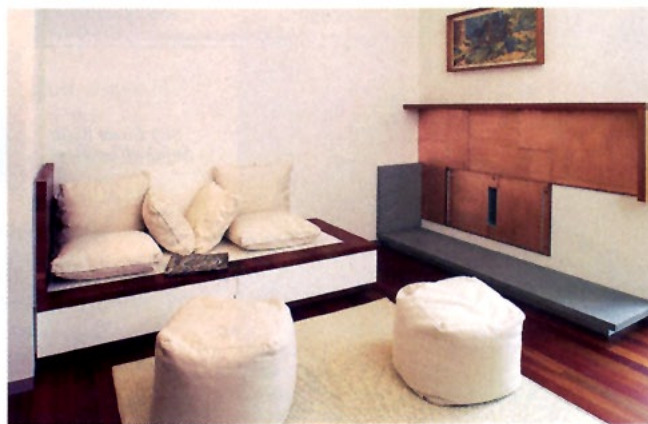
Above, glass-panel garage doors lead to a Brazilian mahogany deck. At left, the main entry, and a small den with a hidden fireplace.