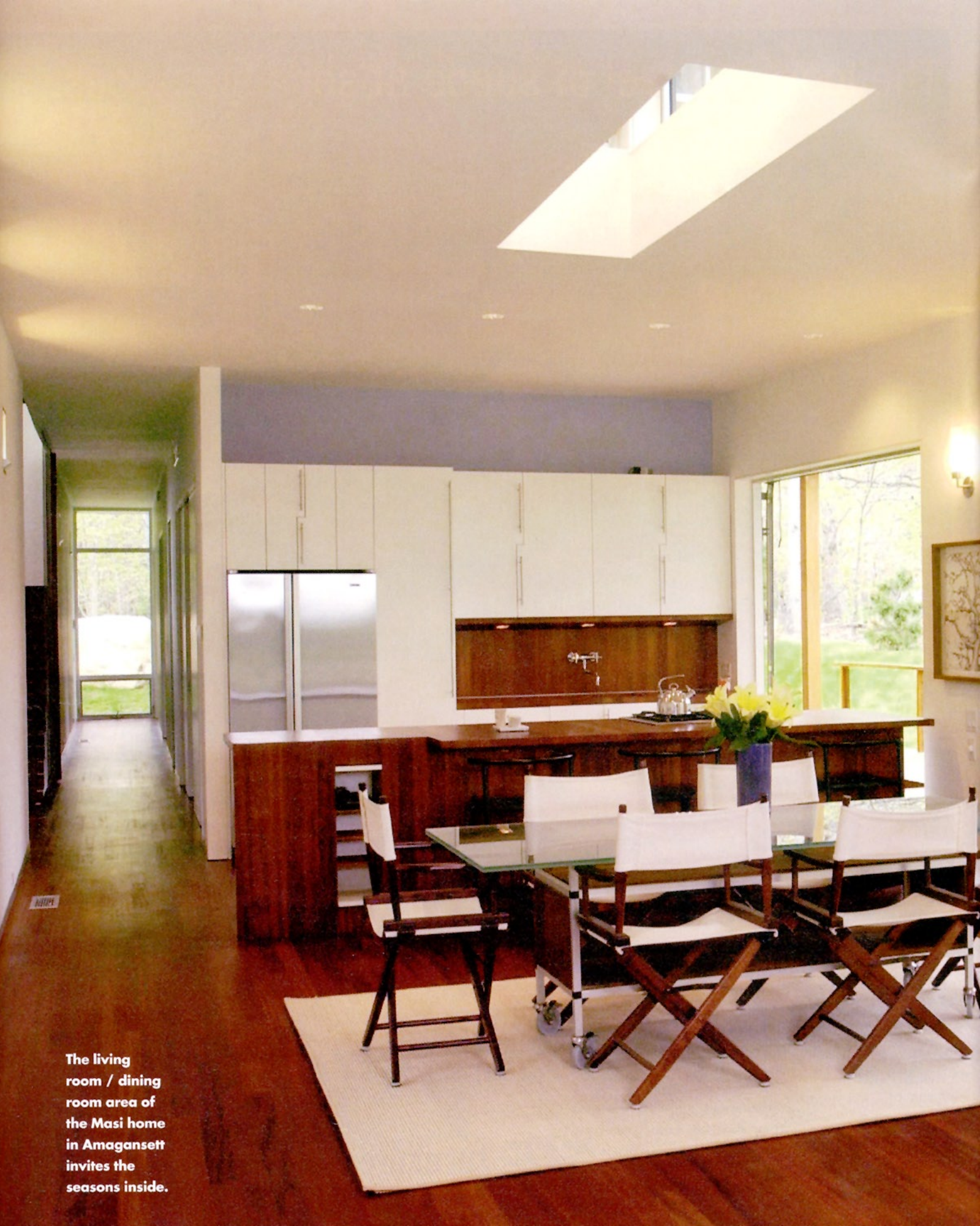
The living room / dining room area of the Masi home in Amagansett invites the seasons inside.